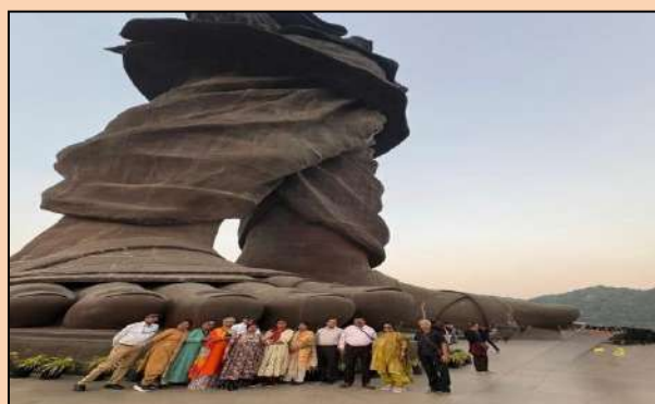
Statue of Unity ( Sardar Ballav Bhai Patel )