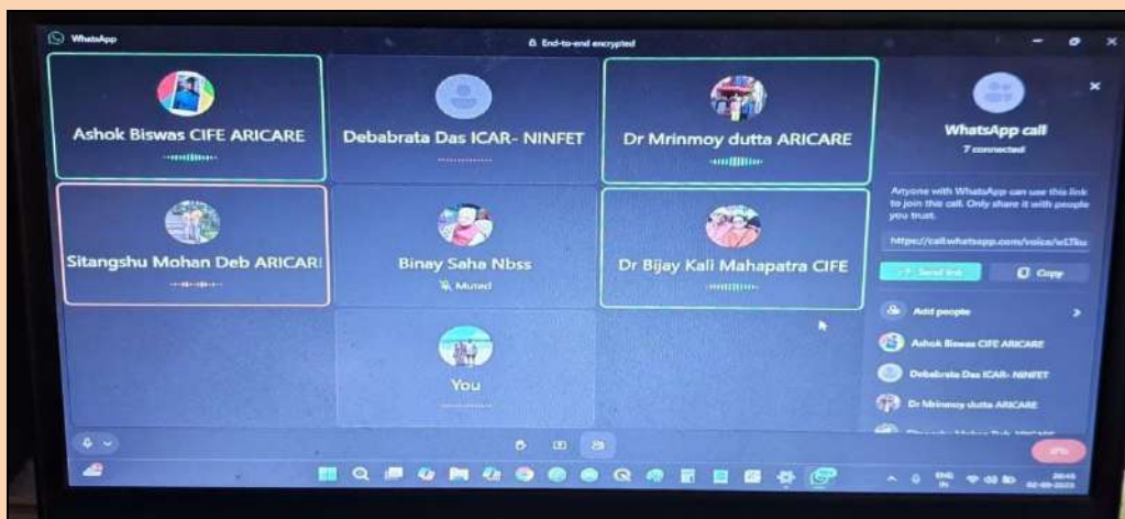
Screen shot of on line meeting of Community Service Sub-Committee