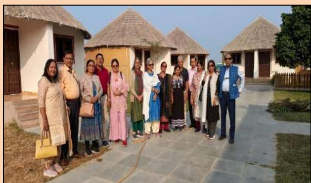
Rann of Kutch in Gujarat