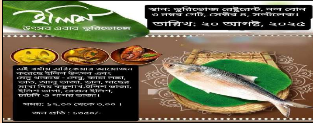
Ilish Utsab as planned at Bhuribhoj , Nalban , Kolkata