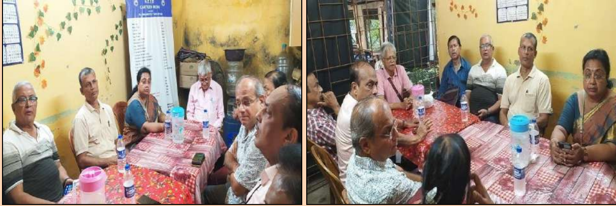
A view of Aricare Social and Cultural Sub-Committee Meeting