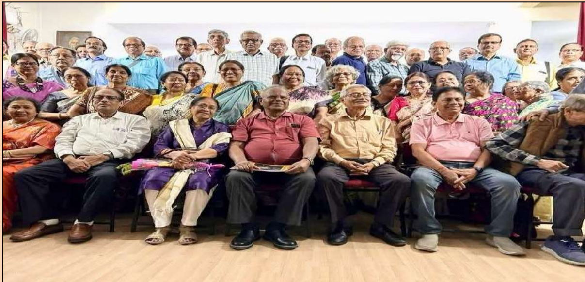
Members and their families attended in Vijaya Sammeloni