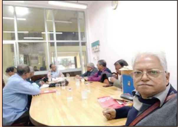
GB meeting held in NBSS & LUP Guest House on 23 rd December , 2025