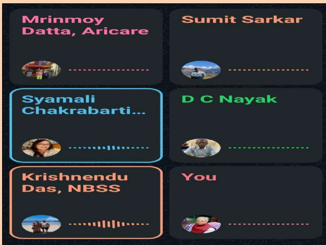
Video Meeting of Social and Cultural Sub –Committee of Aricare for Annual Picnic