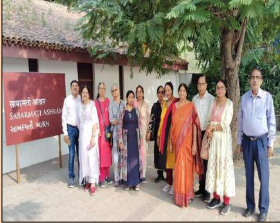
Sabarmati Ashram ( Mahatma Gandhi)