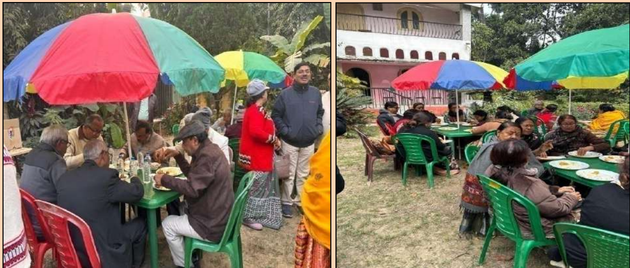
Participating Members are having sumptuous Breakfast /Lunch in the Picnic