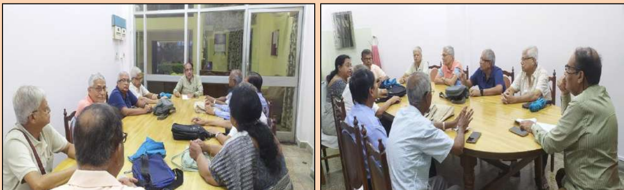
Digital Sub- Committee Meeting