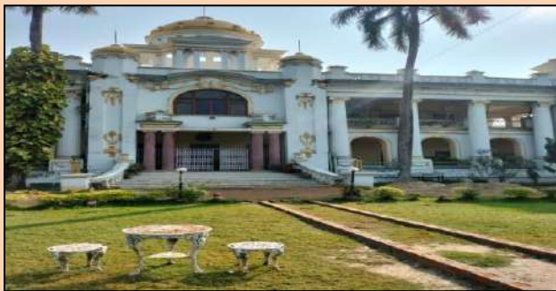
Mahishadal Rajbari in Purba Medinipur