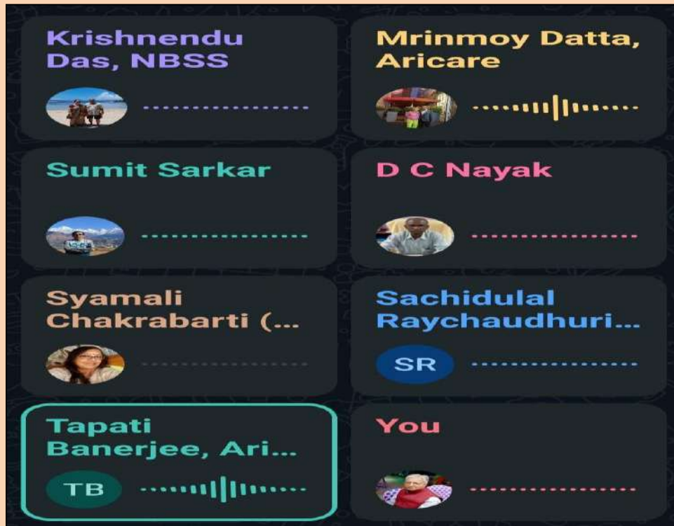
Screen Photos of Participating Persons in the Meeting