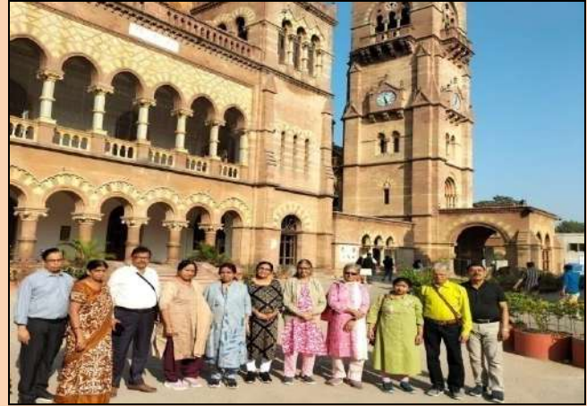
Palace ( Pragmahal / Aina Mahal ) at Bhuj in Ahmedabad