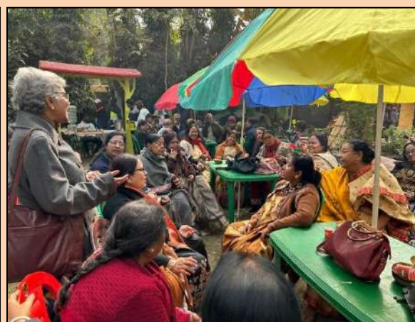
Antyakshari /Song going on in Picnic