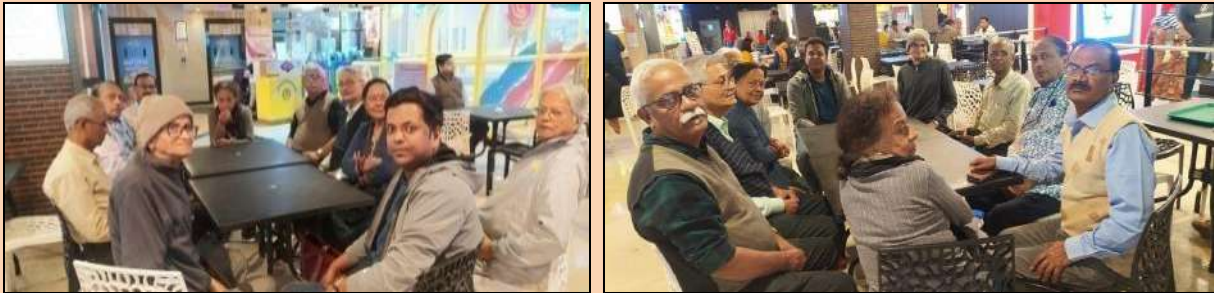
View of the Tour Committee meeting at Highland Park Mall, Kolkata