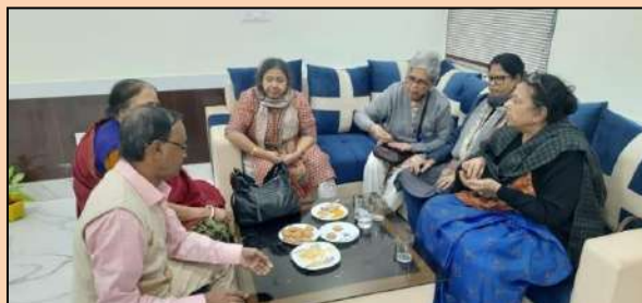
Visitors are at Kakdwip ICAR Research Centre and Enjoying food