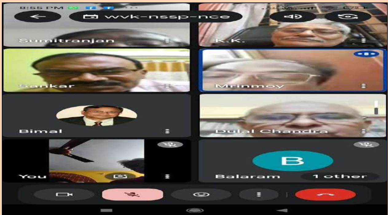
Google meet of Pension Sub- Committee held on 22 nd August, 2025.