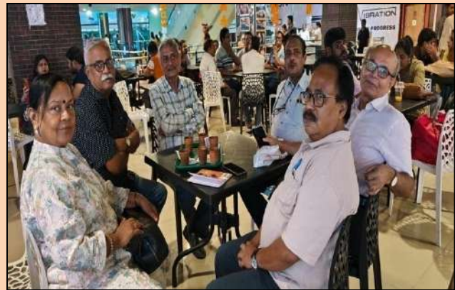
Aricare Tour Sub- Committee Meeting