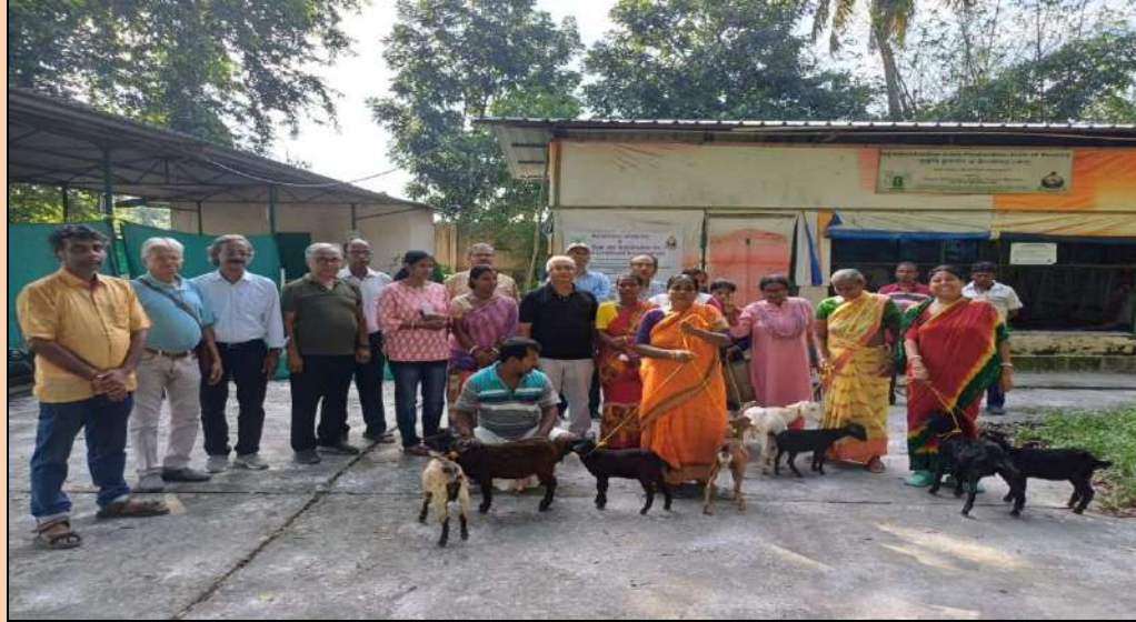
Farmers receiving Black Bengal Goat from Aricare