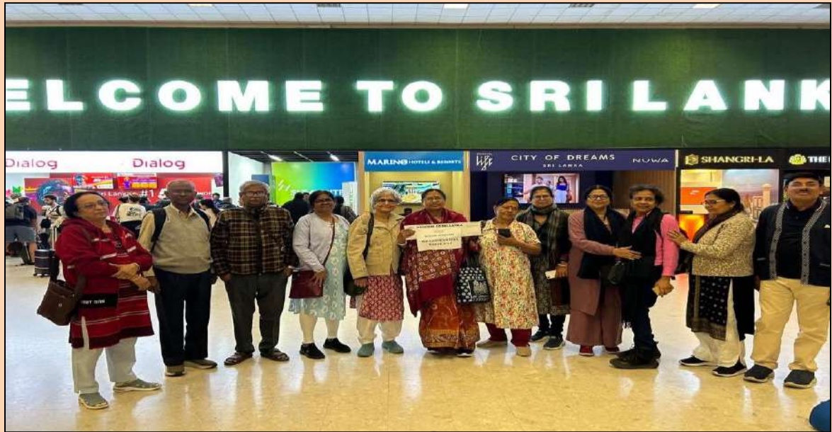
Arrived in Sri Lanka

Aricare has organized an International Tour to SriLanka from 25 th January to 3 rd February , 2026 ( 10 days) to visit different places in Sri Lanka and 13 persons are in this group.