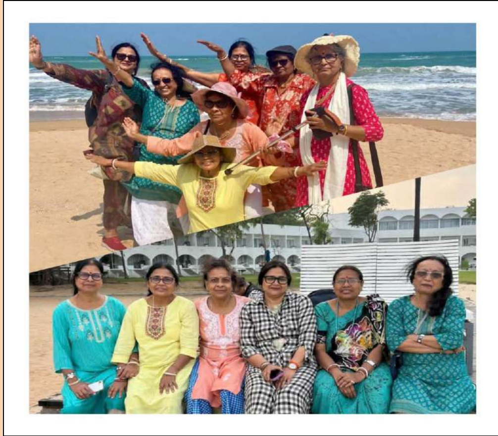
Aricare Members in Sri lankan Island